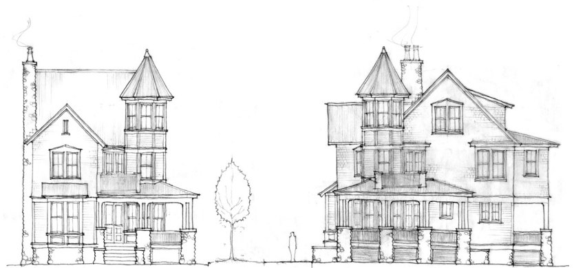
Optional Elevations w/ Corner Tower